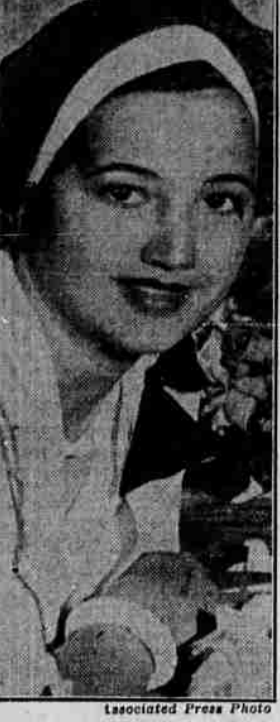
Arline Judge, one of the 1931 Wampus "baby stars," and Wesley Ruggles, motion picture director, announced their engagement recently in Hollywood.