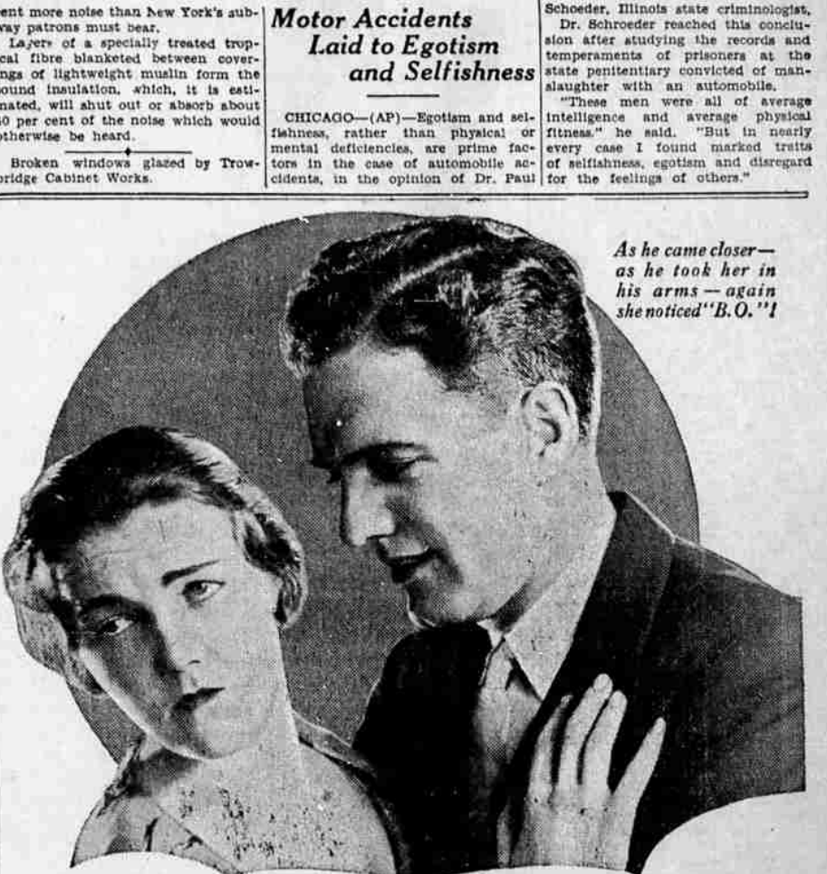
As he came closer—as he took her in his arms—again she noticed "B.O."

Gives Attractive Natural-looking Permanent Waves Tulip Oil Waves $6.50 Other Permanents $5.00 Shampoo & Finger Wave Short Hair, 75c 230 S. Central Phone 1374