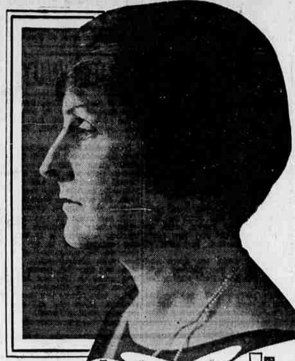
Mrs. Nellie Taylor Ross

Stepping from the train at 9 o'clock this morning before many women were up, Mrs. Nellie Taylor Ross greeted Medford with a refreshing smile. Costumed in black and white with a hint of the Empress Eugenie in the tilt of her hat, the ex-governor of Wyoming showed little sign of fatigue and no indications that politics have robbed her of any feminine loveliness.