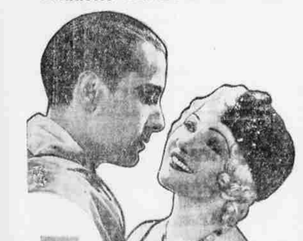
Claudette Colbert, of the swift wit and droll charm, flashes her winning appeal in "Secrets of a Secretary," the talkie of New York society life, which is playing today. Monday and Tuesday at the Fox Rialto. Miss Colbert plays the part of the secretary. It is her first picture since "The Fighting Lieutenant" with Maurice Chevalier and Miriam Hopkins.