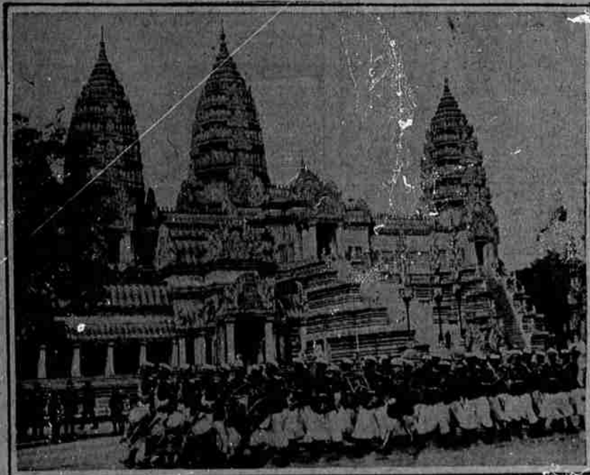
MOROCCO'S SULTAN VISITED FRANCE to attend the Colonial Exposition at Vincennes, and here is the mark of his famous Black Guard passing the replica of the temple of Angkor-Vat en route to Vincennes. Sultan Si Mohammed Ben Youssef was given a brilliant reception and his Black Guard was one of the highlights of the exposition.