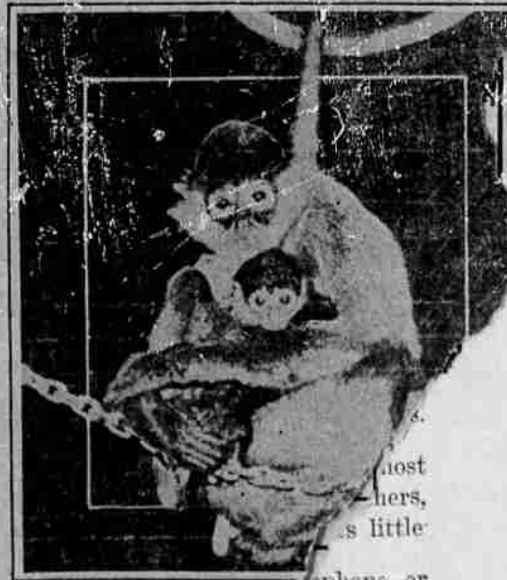
SLEEP BABY, SLEEP , is the thought that might have been thinking as she swung in the Sidney, Australia, startled them both when he ut...