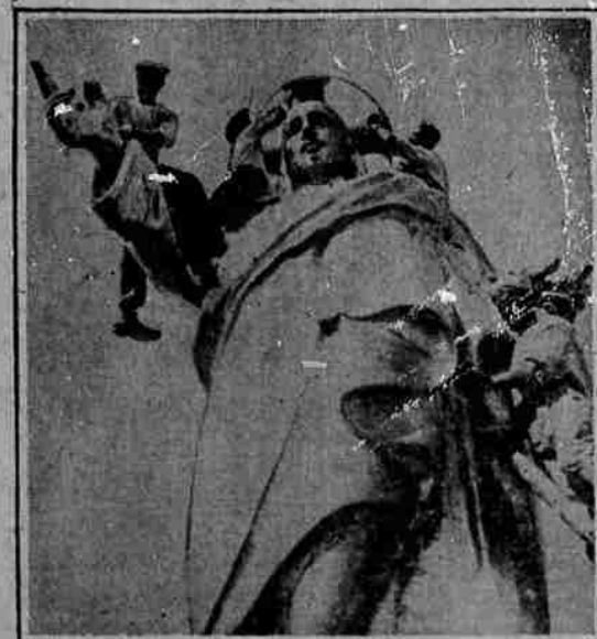
CHRIST TOWERS OVER ROME in this benign statue erected on the belfry of the Church of St. Curore in the Via Marsala. The statue is 20 feet high and is a gift of students of Salesiani Institute of South America. With a special system of illumination, it is visible all over the Eternal City.