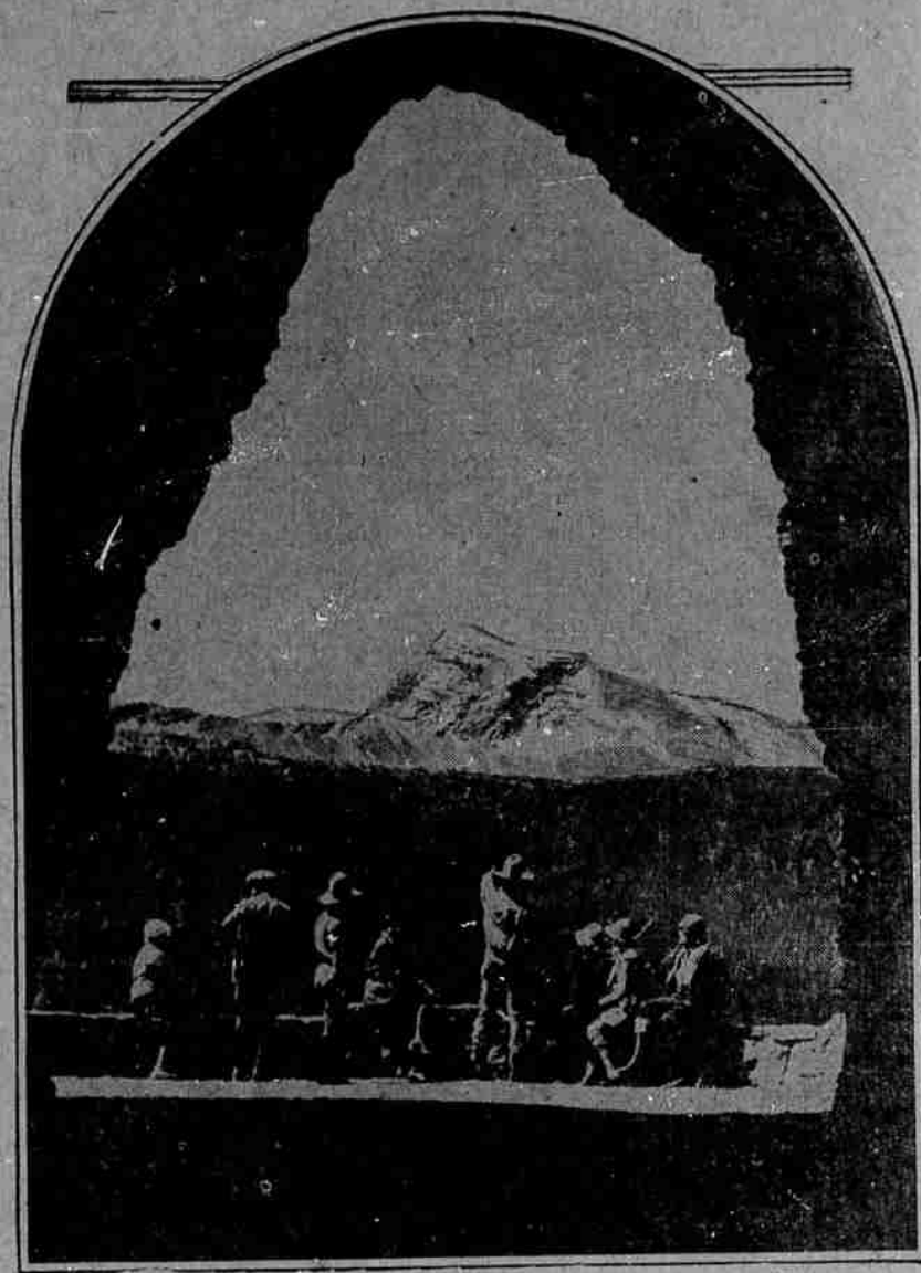
WHERE MEN ARE MEN and mountains reach up to greet the sky—that's America's great west. And this is Heaven's Peak seen from the Going-to-the-Sun Highway in Glacier National Park. The guide is pointing to the immortal beauty of the peak from a tunnel along the highway.