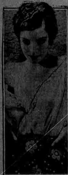
DEBUTANTE of the movies is Conchita Montenegro, who was given this title following a "civil war" in Hollywood when Fox named her and two others to the honors ordinarily enjoyed by the Baby Wagon Stars. She's 19, and—oh, exquisite.