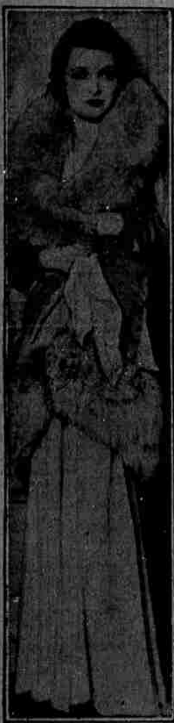
LADY LUCK might be the title of Mme. S. W. D. Baroin at the Riviera where she won this beautiful fur-trimmed creation at a cost of nothing. Raffle tickets sold for 1000 francs each. But the night before she had been lucky at the roulette tables.