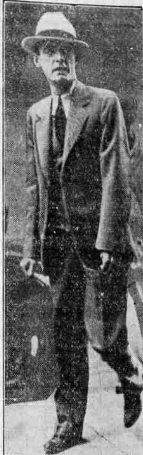
The maximum sentence of four years in prison and a $11,000 fine was imposed on Jack "Legs" Diamond, New York gangster, who was found guilty of two violations of the prohibition law.