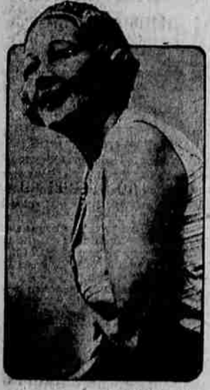
Anna Q. Nilsson is shown arriving in Los Angeles to resume her moving picture career...