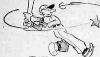
HE HAS BEEN SETTING THE PACE FOR THE BOYS IN THE NATIONAL LEAGUE