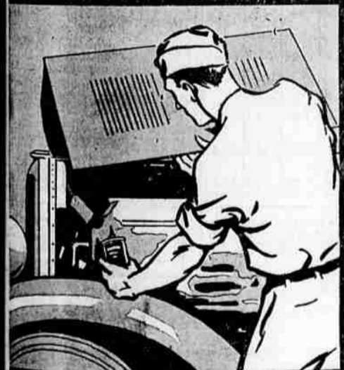
A drop of Oronite Handy Oil for generator or fan—a pump well packed with Zerolene Waterproof Grease—Standard Oil makes separate and special products for each separate lubrication need.

At your home station or hundreds of miles away... YOU GET SPECIAL VALUES AT "STANDARD"