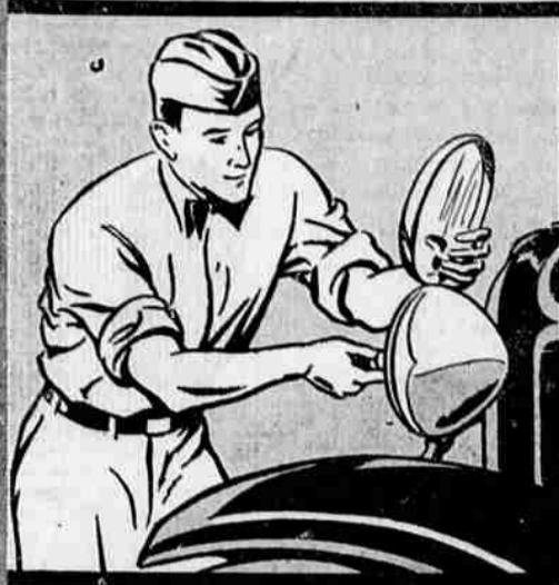
"Shop without leaving your car"—light globes—oil filters—valve caps—dozens of useful motoring accessories—right at hand while you're getting gas and oil at Standard Stations, Inc., and Red White & Blue Dealers.