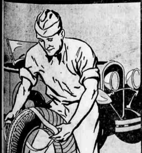
Tires—tubes—as many as 100 motoring values are offered at Standard Stations, Inc., and 11,000 Red White and Blue Dealers. Values that give you more car for your money—more enjoyable motoring—every way!