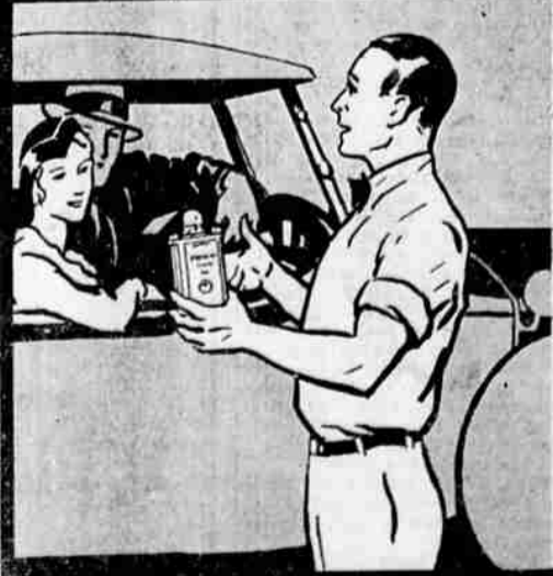
For only $3.50—the new Zerolene Valve Oiler is installed with a full quart of special Zerolene Valve Oil—another exclusive Standard value—a bigger dollar's worth for your car!