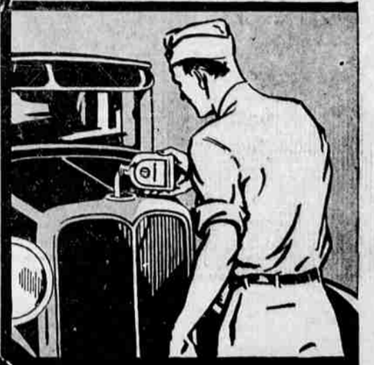
R and T Radiator Rust Remover, and Rust Preventive—two more new products in Standard's fine line. Your dealer will put them in for you. Keep your radiator cool and clean.