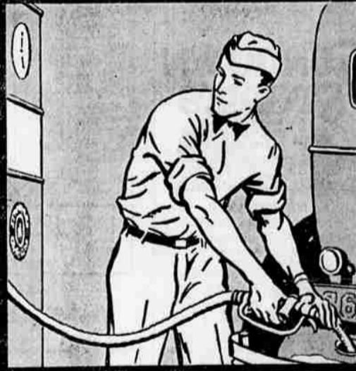
The finest gasoline we have ever produced without Ethyl—"Standard" Gasoline has won hundreds of thousands of motorists in just 6 months—premium quality at no increase in price!