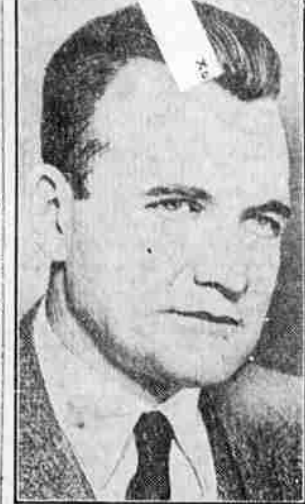
George W. Malone, Nevada state engineer and secretary of the Colorado river commission, has announced his candidacy for the post of national commander of the American Legion.