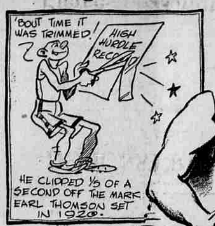
HE CLIPPED 1/5 OF A SECOND OFF THE MARK EARL THOMSON SET IN 1920.