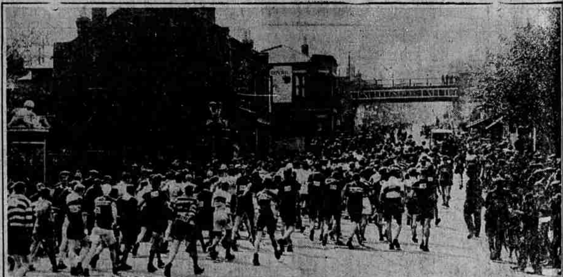
MMI MMI! HOW'D YOU LIKE TO TAKE A WALK? —Well, if you do, you might join this ambitious crowd of 300 young men, for they are competitors in the annual English national 20-mile road walking championship. Here they are shown hustling off from the starting line at Enfield.