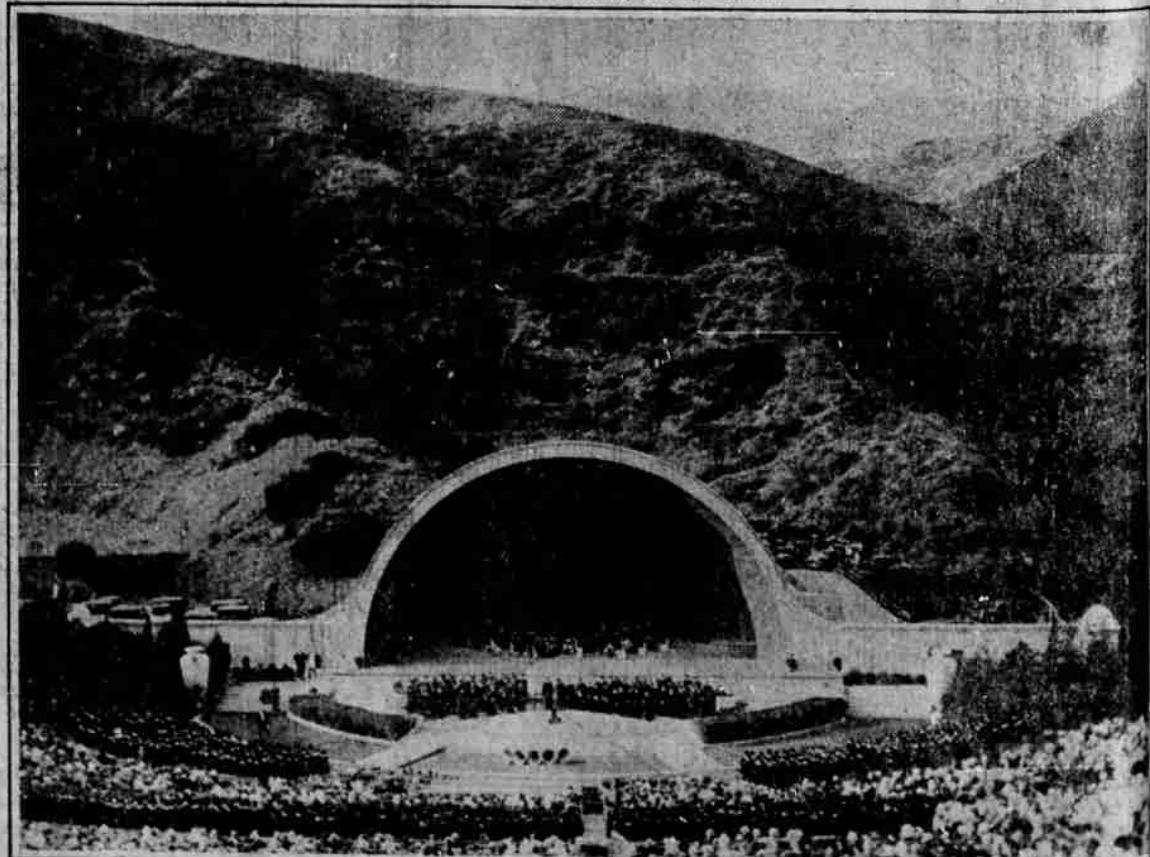
HOW THEY GRADUATE IN CALIFORNIA —No stuffy halls will do for seniors at University of California when they take degrees. Instead, they chose the famous Hollywood Bowl at Los Angeles, in which to hold impressive open-air Commencement exercises. This photo was taken as the 982 graduates awaited their sheepskins.