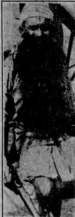
TAKES A PAKE to comb his whiskers. This rickshaw man in Ceylon vows not to apply the scissors until his countrymen are granted independence from England.