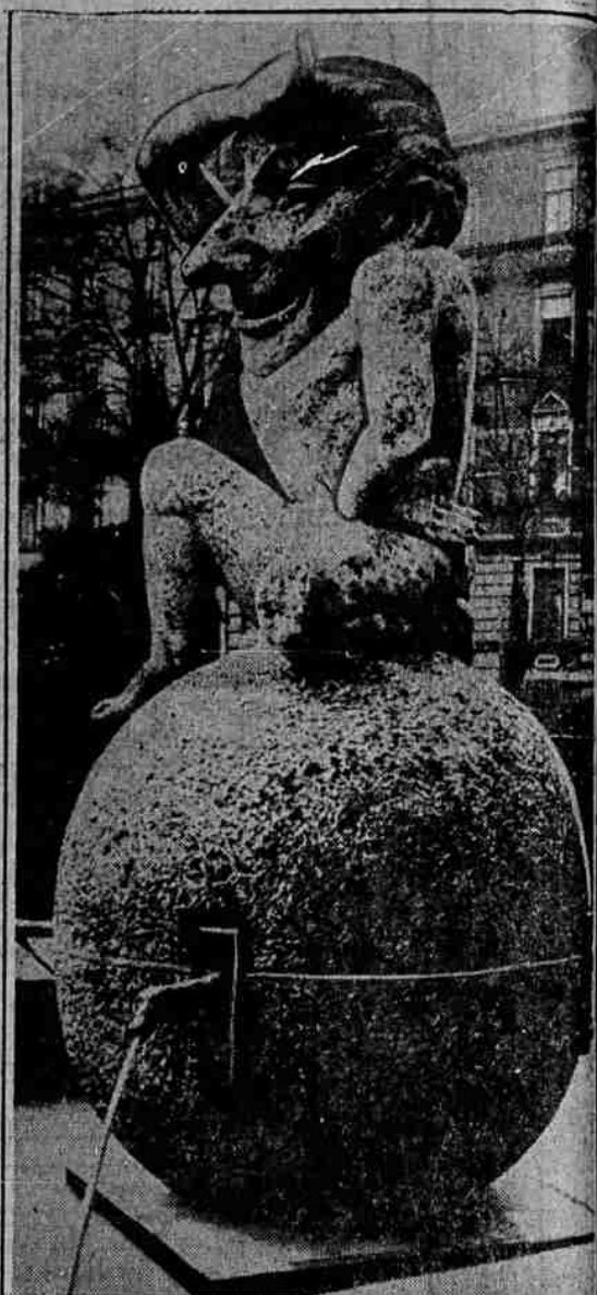
A PRETTY NOSEY FELLOW , this grotesque character, but kids in Karlsruhe, Germany, like him just the same. The figure represents "Dwarf-Nose," a character in one of the fairy tales of Wilhelm Hauff, and it is one of the few fairy tale characters ever to be perpetuated in stone.