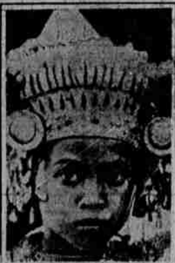
SPIFFY CHAPEAU! —This is the kind of headgear little girls in Bali get when they become good dancers. The one shown above is made of gold handiwork.