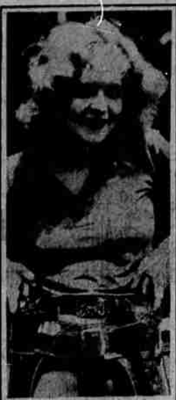
HER GOLDEN LOCKS may have fooled you, but this is Clara Bow, red-haired "It" girl of the screen, ready to leave her Beverly Hills home for Nevada, where she will recuperate from a nervous breakdown.