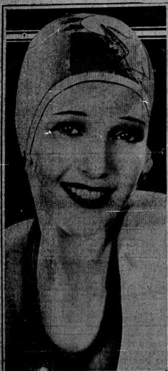
FAIR AND COOLER , as the weatherman might say after glancing at this beautiful barometer. Here is lovely Loretta Young, film star, giving us that "come-along-in-the-water-s-fine" look just before taking a plunge.