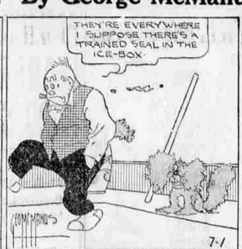
THEY'RE EVERYWHERE I SUPPOSE THERE'S A TRAINED SEAL IN THE ICE-BOX.