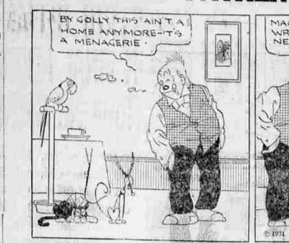
BY GOLLY THIS AINT A HOME ANYMORE-IT'S A MENAGERIE.