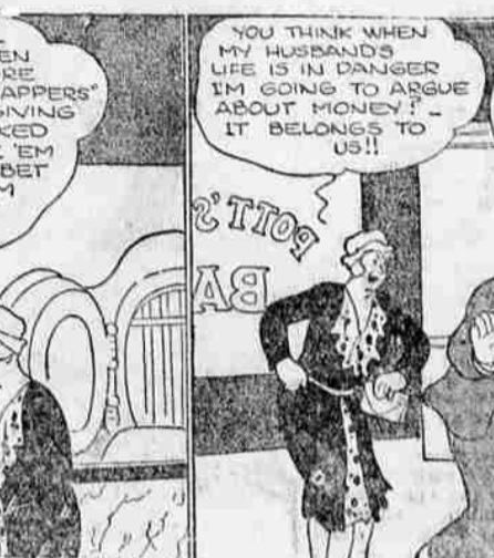
YOU CANT FOOL ME- YOUR HUSBANDS BEEN KIDNAPPED AND YOU'RE GIVING IT TO THE KIDNAPPERS AND I BET YOU'RE GIVING 'EM WHAT THEY ASKED FOR- NEVER GAVE 'EM NO ARGUMENT- I BET YOU COULD GET HIM BACK FOR TEN THOUSAND.