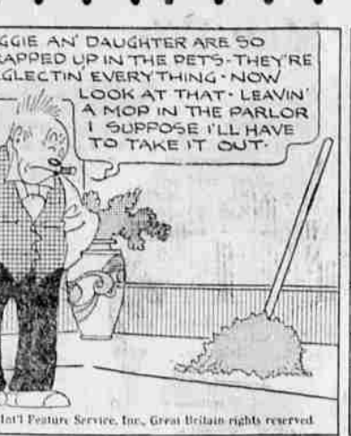
MAGGIE AN' DAUGHTER ARE SO WRAPPED UP IN THE PETS- THEY'RE NEGLECTIN' EVERYTHING- NOW LOOK AT THAT- LEAVIN' A MOP IN THE PARLOR I SUPPOSE I'LL HAVE TO TAKE IT OUT.