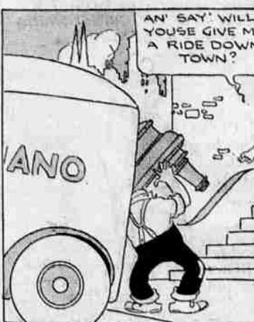
By SOL HESS