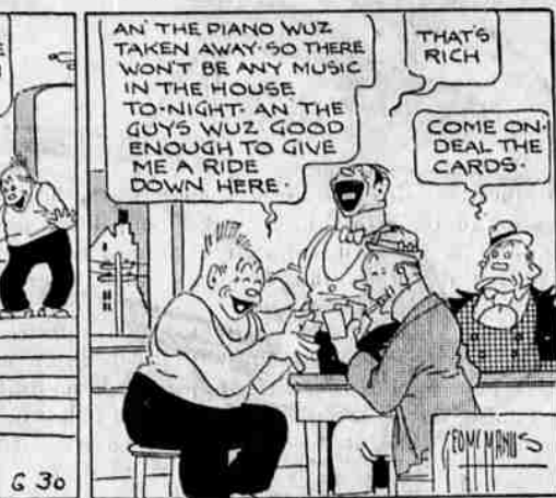
By SOL HESS

Am. Tel. & Tel. 17 1/2% Standard Oil 32 1/2% Cul. Gas 32 1/2% Curtis Wright 3 1/2% General Electric 43 1/2% General Motors 38 Kennecott Copper 20 1/2% Mont. Ward 20 1/2% Radio Corporation 19 1/2% Reading 7 1/2% Sears Roebuck 55 1/2% S. P. 83 Trans. Am. 8 United Aircraft 30 1/2% U. S. Steel 100 1/2% Corporate Trust Shares 5 1/2% 5-Year Fxd. Trust 7 1/2%