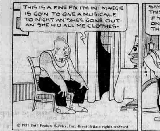
THE NEBBS—Dear Fanny