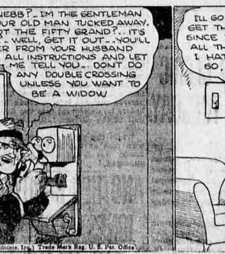
THE NEBBS—Watch Your Step