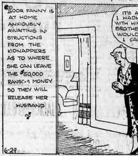
THE NEBBS—Watch Your Step