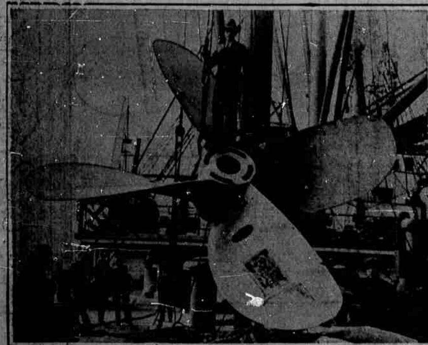
LEAVE IT TO THIS PROPELLER to make things hum when it is attached to the Canadian freighter Cornwallia . Weighing seven tons, the huge propeller is shown being lifted from the hold of the liner Alaunia after its voyage from England to Montreal. The holes in the blades are to lessen noise and vibration and increase speed.