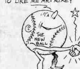
THE NEW BALL MAY PROVE A BIG HELP TO EPPA AND THE OTHER OLD TIMERS.