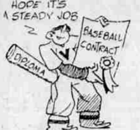
HE WENT DIRECTLY TO THE PHALLIES FROM THE CAMPUS OF WEST VIRGINIA IN 1912.