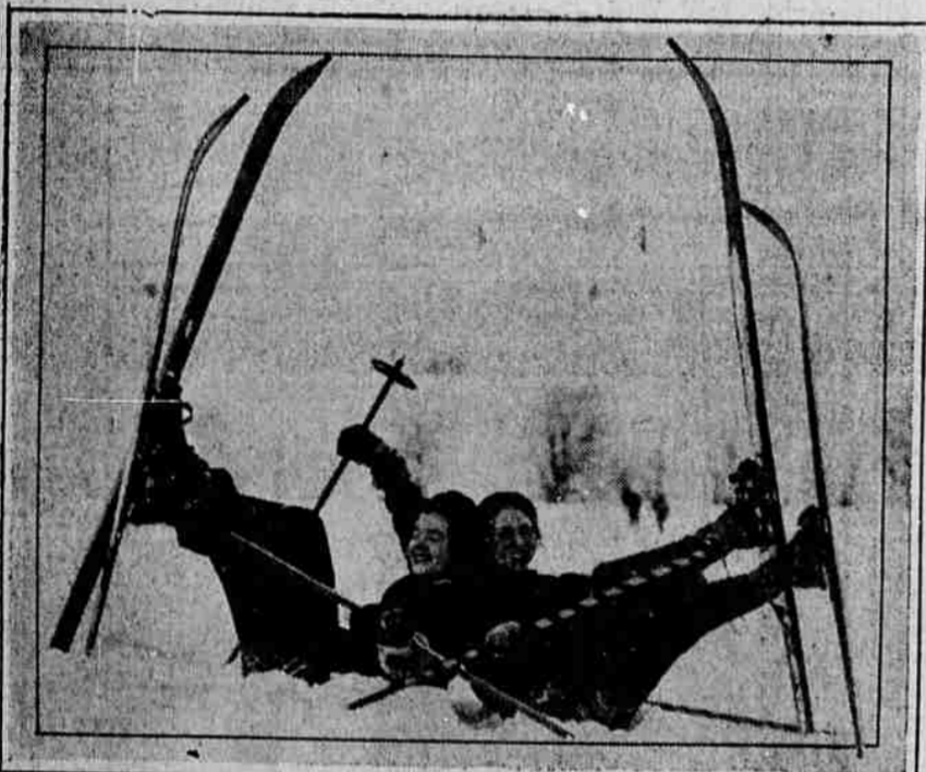
AN IDEA OF HOW THEY FALL FOR WINTER SPORTS at Ottawa, sports capital of Canada, may be had from the above picture. These girls were practising for the annual winter carnival when they got their skis mixed up.