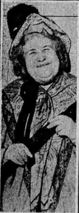
WHEN THEY LAUGH the world laughs, too. Easy to tell at a mile's distance is the big smile of Jack Oakie, above, film comedian. More familiar to Europeans is the grin of Mme Olga Moussine-Pouchkine, below, veteran Russian actress, who is preparing for an American debut.