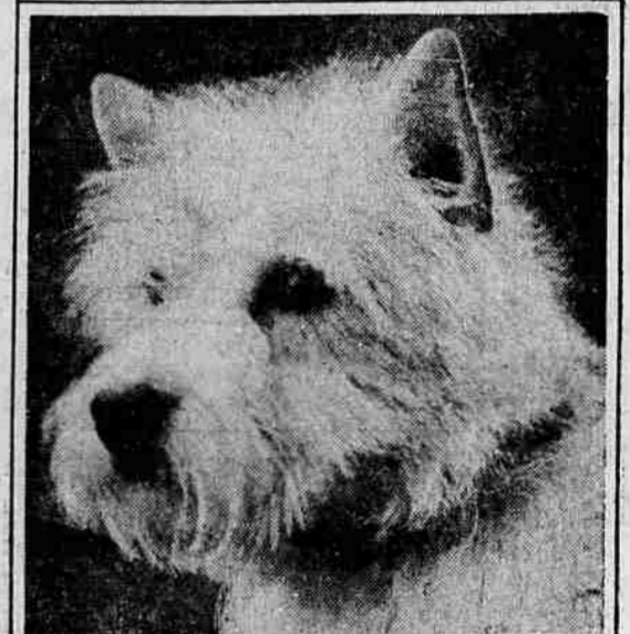
THEY WENT TO THE HEAD OF THEIR CLASS. did these handsome dogs, at the Birmingham National Dog Show recently held in England. Witley Punch, above, a clumber spaniel, won four first prizes while Reba Romance, below, won top honors in the terrier class. And don't they look like proud champs?