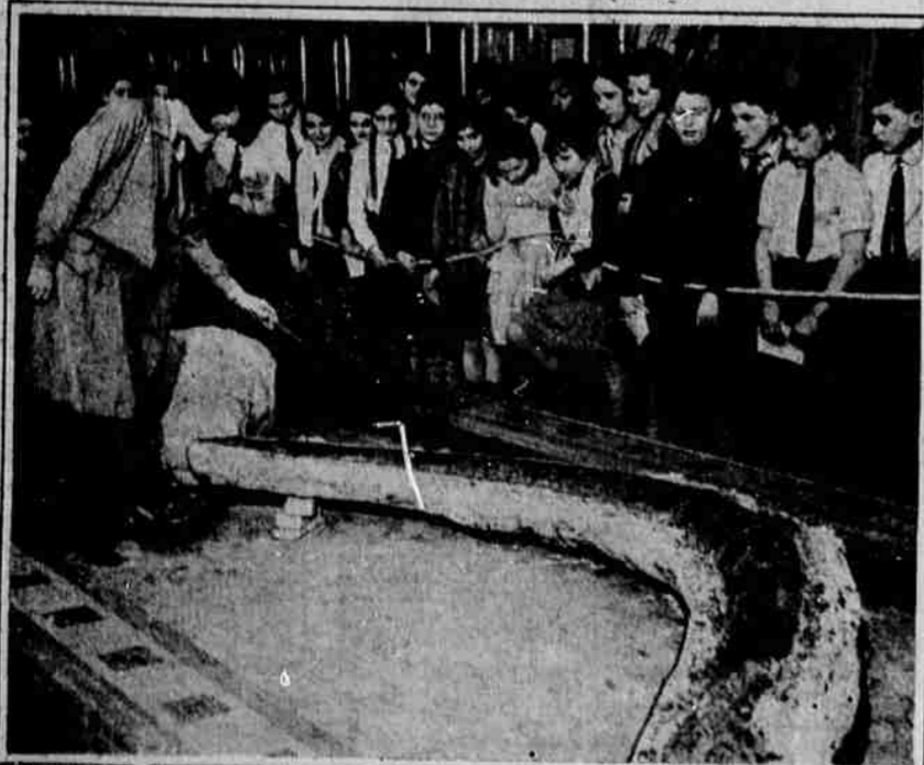
SOME ON. PULLED A BIG BONE when this portion of the skeleton of a mastodon was unearthed recently near Cromwell, Ind. The above photo shows a group of children looking at the tusk and skull of the big creature at the Buffalo (N. Y.) Museum of Science. The tusk is 12 feet long, and with the plaster covering weighs half a ton.