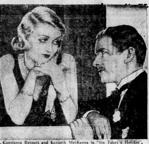
Constance Bennett and Kenneth MacKenna in "Sin Takes a Holiday," a Pathe Feature