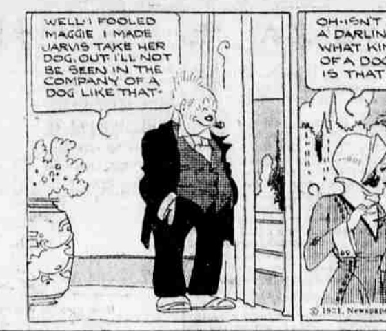
THE NEBBS—Spilling the Beans