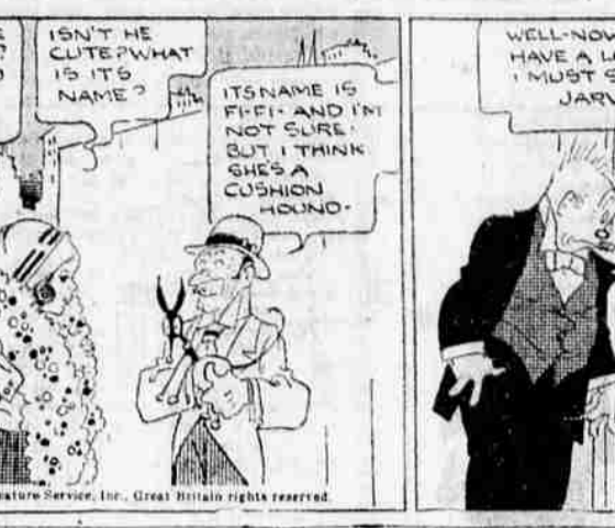
THE NEBBS—Spilling the Beans