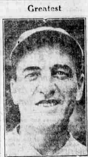
Joe Judge, veteran of 15 campaigns with the Washington Senators, has been recognized as the greatest fielding first baseman in American league history. He has led his league rivals in fielding of ten for eight seasons.

SALEM, Feb. 7.—(AP)—A prediction made before the opening of the legislature by Charles V. Calloway, chairman of the state tax commission, that the tax question would overshadow all other issues in the session, appears in a fair way to be fulfilled, with four weeks of the session gone and tax matters becoming more complicated.