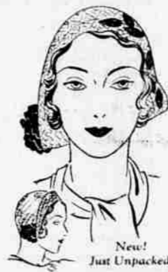
New! Just Unpacked!

This "My Own" Hat Shows Lots of Hair! ... and That's a Very Important Fashion