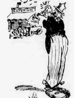
The sales' son, who started with a 'n' in 'n' front, is home on parole. Folks that eat onions allus seem t' be outspoken.