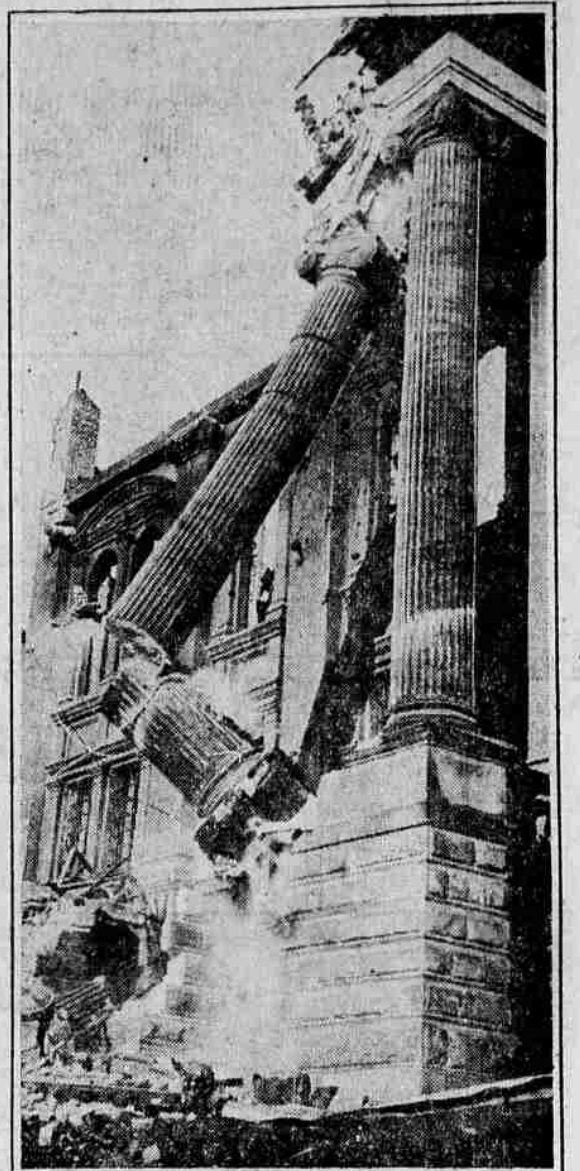
CRASH! AND A PILLAR OF JUSTICE BITES THE DUST —This remarkable action photo was taken in Seattle, Wash., as a truck pulled down one of the great columns of the old King County courthouse.