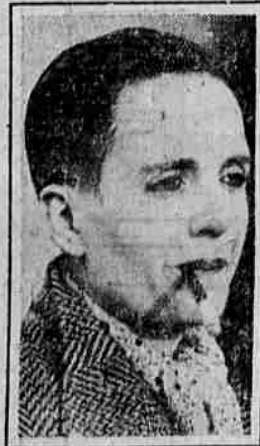
SHE'S MODERN —Here is Miss Michel Pym, noted woman author, shown as she arrived in New York from London, where she attended the Round Table Conference.