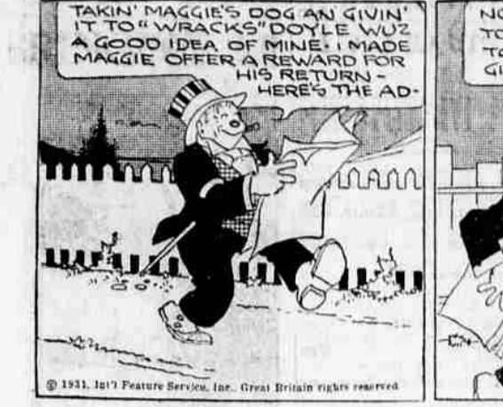
© 1931, Int'l Feature Service, Inc. Great Britain rights reserved.