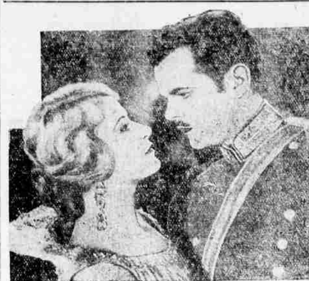
Lawrence Tibbett, Grace Moore and Adolphe Menjou thrilled an appreciative audience at the Fox Craterian Theater last night.

The story opens with a meeting between Michael, the Russian lieutenant, played by Tibbett, and Tania, the princess, played by Miss Moore. The meeting occurs on board ship bound for Turkestan, whence Michael is bound for duty. The harmless flirtation between Michael and Tania ends in real love. When the destination is reached, Michael learns that Tania is the fiancée of the governor and, furiously angry at her for deceiving him into loving her, Michael forces his way to a hall of the royal castle, and confronts her. The governor discovers the intrusion, and immediately transfers Michael to a wild frontier station where the savage Khurzi troops make a practice of murdering their officers. Angry at his trade at the palace, Tania leaves with her uncle