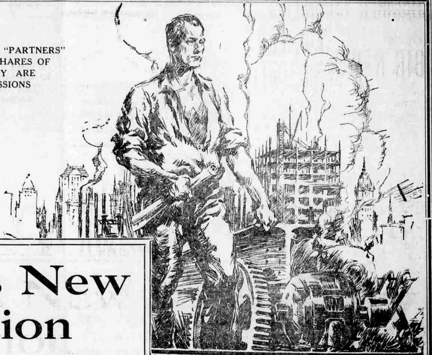
"PARTNERS IN PROGRESS"

IN OVER 6000 HOMES IN "COPCOLAND" MAY BE FOUND "PARTNERS" OF THIS COMPANY IN WHOSE HOMES PREFERRED SHARES OF THE CALIFORNIA OREGON POWER COMPANY ARE COUNTED AMONG THE HIGHLY VALUED POSSESSIONS