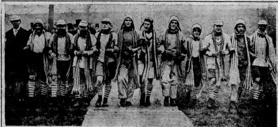
MARCHING AS TO WAR —Here are members of opposing English teams, the Collegers and Oppidans, marching arm in arm to the playing field to engage in the "Wall game," a contest staged annually at Eton as part of the St. Andrew's Day celebration.