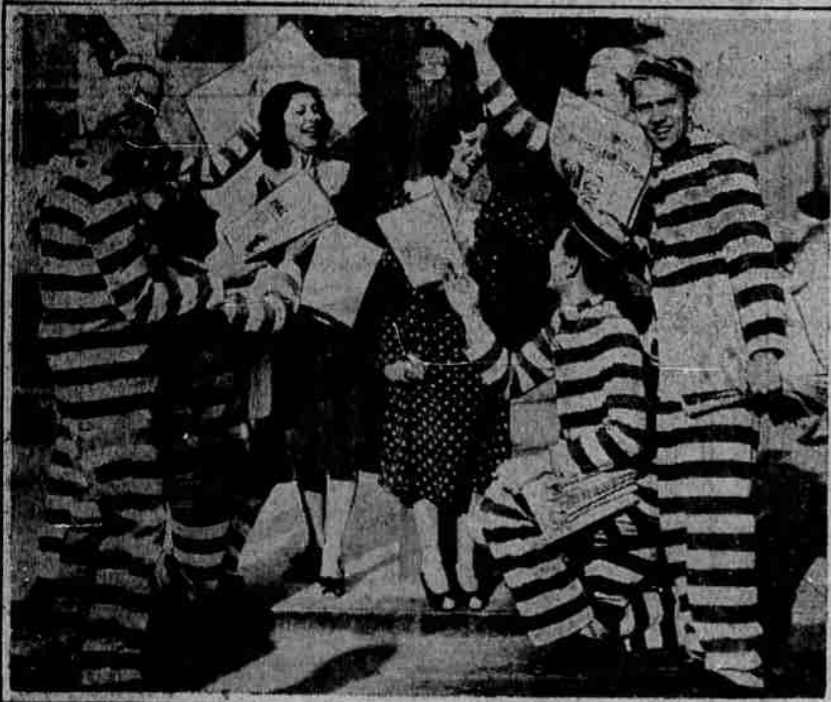
IT WAS "CELL-OUT" FOR THESE NEWSIES and a good "break" for these fair co-eds of the University of Southern California when journalism students took to convict garb in a promotion scheme to sell copies of their annual publication, "The Razzberry." They sold 2000 copies, a big success.