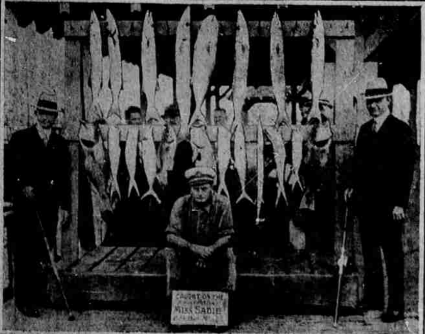
IT WILL MAKE PRESIDENT HOOVER plenty envious, perhaps, to know that one of his cabinet members, Arthur M. Hyde, secretary of agriculture, made this splendid catch in the Gulf Stream, off Miami, Fla., recently. The collection includes kingfish, red bass, barracuda and dolphin. Secretary Hyde is shown at the right.