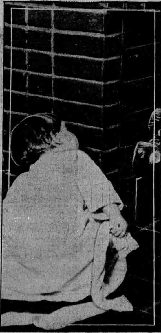
IS THERE A SANTA CLAUS? WELL, HERE'S THE PROOF. If you've been real good, and expect a visit from Santa, the first thing to do is to take a peek up the chimney to see that the way is clear, as the little fellow at the left is doing. This fact ascertained, hang up your stocking (or, as the next picture indicates, someone else's). And when you awake in the morning, lo and behold, there is the stocking crammed with gifts. The reason everything came off as predicted was that Santa, instead of coming by reindeer sled, chose a fast automobile!