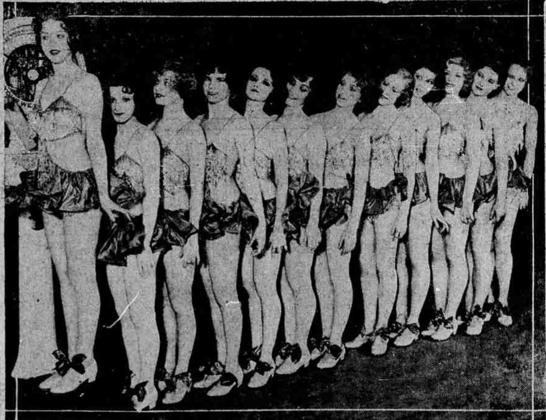
THEY REALLY HAVE SUCH CHARMING WEIGHTS —In one of the riskiest of experiments, these well-proportioned chorus girls fed for 16 weeks on sweets and other foods reputed to be fat producers, just to see if they could change their weights. Well, here they are, lined up after the experiment waiting to be weighed. And what do you suppose? They didn't put on an ounce. They are all members of the Fanchon and Marco dancers.