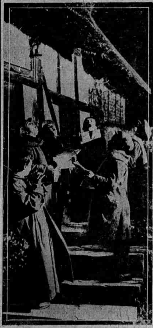
CROONING CHRISTMAS CAROLS , these young singers are shown above in a setting as picturesque as a rare old print, as they serenaded on the steps of the Anne Hathaway cottage, near Stratford-on-Avon, in England. Anne, you recall, became the wife of William Shakespeare.