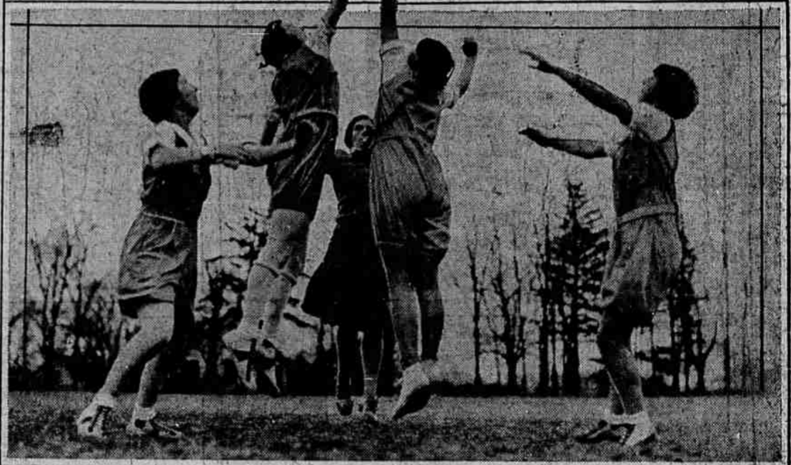
EXERCISE FOR COLLEGE GIRLS NOWADAYS isn't as gentle as it used to be, as you can observe from these scenes. The photo above shows a snappy bit of action during the field hockey game between freshmen and juniors at Savage School of Physical Education in Brooklyn, N. Y. Fighting for possession of the ball in the basketball game below are students at the New Jersey College for Women, at New Brunswick, N. J.