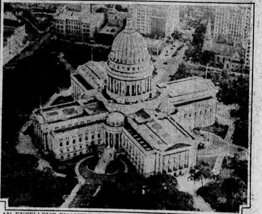
AN EXCELLENT EXAMPLE OF SYMMETRY IN ARCHITECTURE is the Capitol building at Madison, Wis., shown above in a striking scene from the air. The original state house was partially destroyed by fire in 1904 and in its stead this magnificent structure was erected at a cost of $7,000,000.