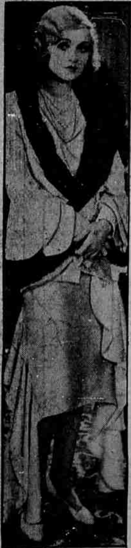
DEPEND UPON charming Constance Bennett, above, of the movies, to present a striking appearance in fashion's newest creations. She is shown here in a new ensemble, a feature of which is the high, fur-trimmed collar.