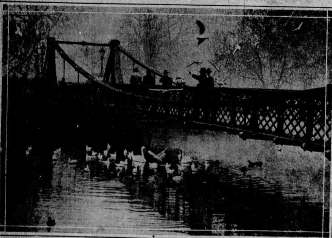
SO QUIET AND RESTFUL IS THIS SCENE that you might easily take it for a spot in some rural suburb. But this photo was taken on the bridge of St. James Park, London, in the dusk of an autumn afternoon and shows strollers feeding hungry swans and gulls.