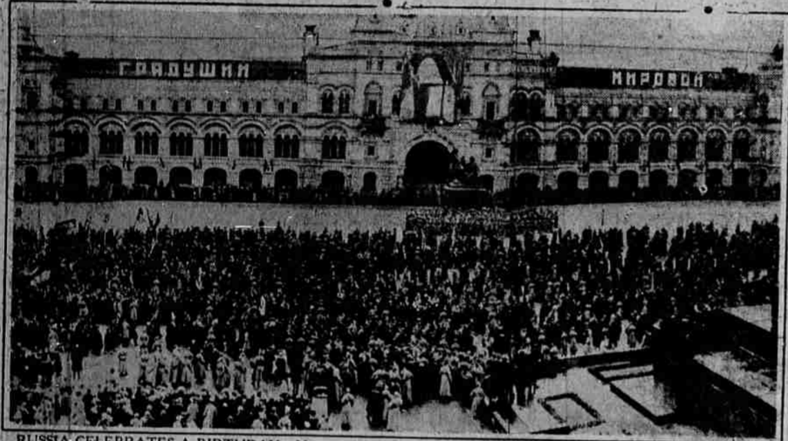
RUSSIA CELEBRATES A BIRTHDAY —Here is a view of part of the crowd of more than 500,000 Communists who gathered in Red Square, Moscow, recently, to celebrate the 13th anniversary of the founding of the Soviet Union. At the time this picture was taken a detachment of troops was giving an exhibition of maneuvers.