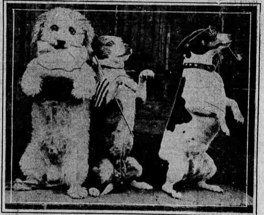
THEY'RE SELF-SUPPORTING AND PROUD OF IT —They didn't have any pedigree or social ranking to speak of, but these pups won prizes at the S. P. C. A. dog show held recently in Philadelphia. Left to right are Rags, Lu Lu Montana and Queeny.