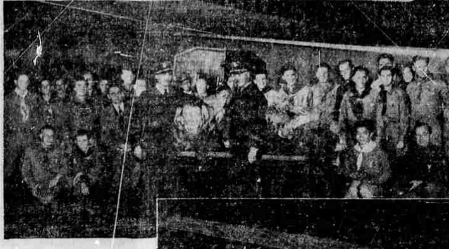
Above—Two transcontinental and Western Air pilots and load of air mail taken from New York to Los Angeles in 36 hours.