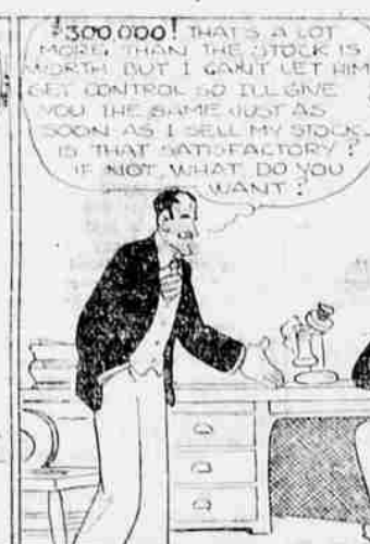
By SOL HESS