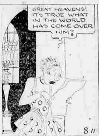
THE NEBBS—Oh, Promise Me