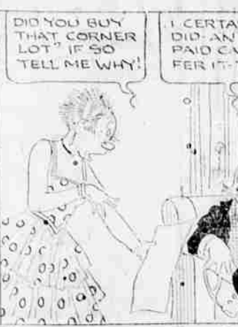
THE NEBBS—Oh, Promise Me