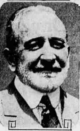
Senator Joseph D. Phelan.

SAN JOSE, Cal., Aug. 8.—(AP)—The hand of death today had ended the career of ex-Senator J. D. Phelan, after an illness which lasted since May of this year.