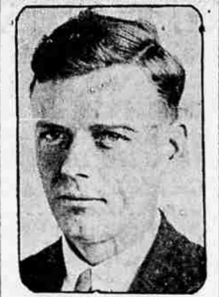
CHARLES LINDBERGH Lindbergh urged uniform flying regulations for all nations and predicted the next few years would bring transoceanic air routes to unite continental services already established into a network covering the world.

Previous to the delivery of the tale on the broadcast chain, Col. Lindbergh spoke at 3:25 p. m. (E. S. T.) from the CBS studios, by short wave only, to various countries of the world including Sweden, where his father was born. In his first formal radio address