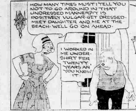
THE NEBBS—The Boss