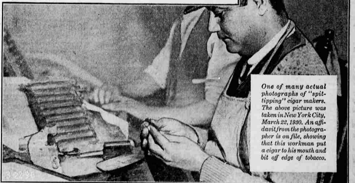
One of many actual photographs of "spit-tipping" cigar makers. The above picture was taken in New York City, March 22, 1930. An affidavit from the photographer is on file, showing that this workman put a cigar to his mouth and bit off edge of tobacco.

... the war against Spitting is a crusade of decency... join it. smoke CERTIFIED CREMO!