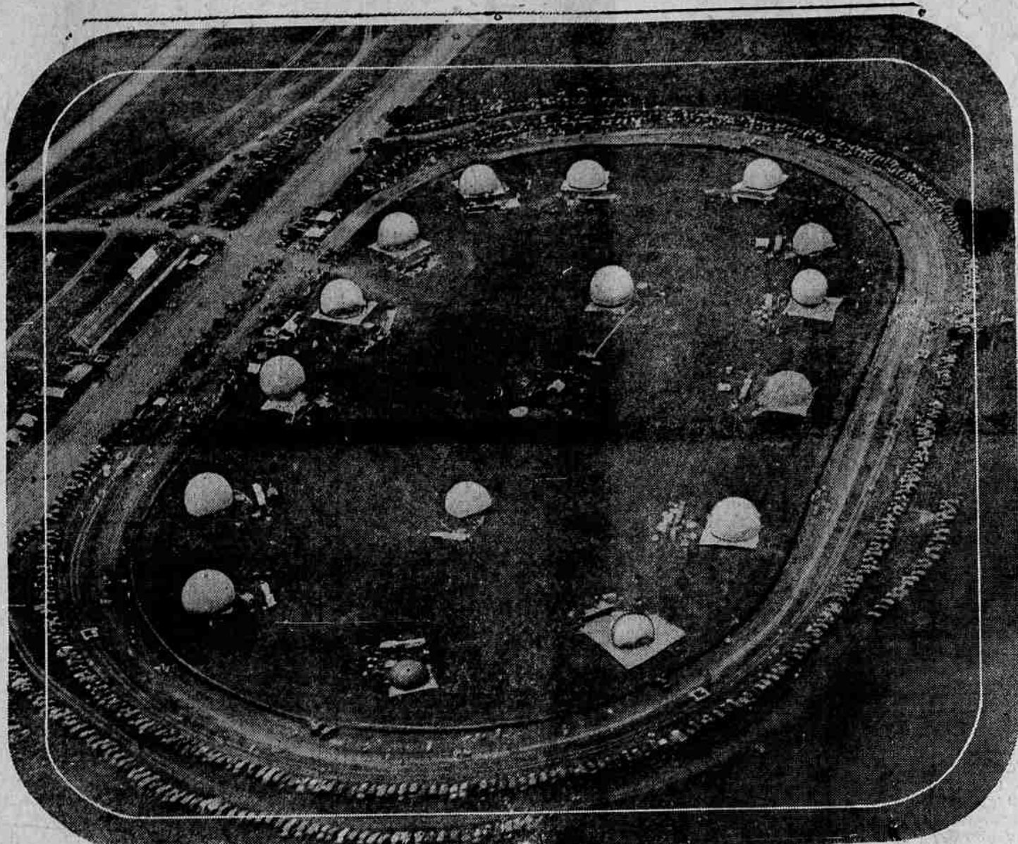
WHEN NATION'S MOST DARING BALLOONISTS COMPETED AT HOUSTON —Entries in the national elimination balloon races are shown in this striking picture, poised for the take-off at Houston, Tex. The contest was held to select representatives of the United States in the international races to be started from Cleveland on Labor Day.