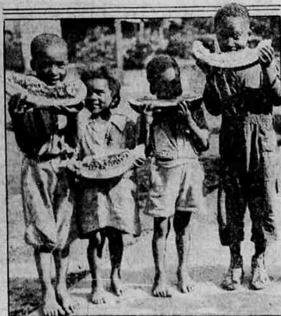
YUM, YUM! —No wonder these dusky youngsters are smiling. You would be, too, if you had just tasted watermelons like these. They were snapped not in Dixie, but at Akron, O.