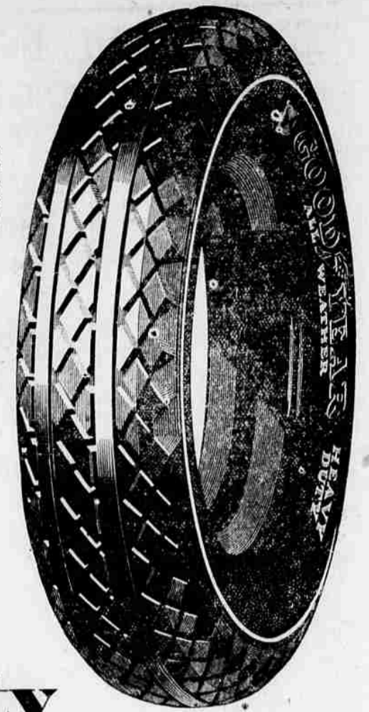
The tire pictured is the handsome new Goodyear Heavy Duty in the 4.50-21 size (formerly 30 x 4.50)

The tire shown in this advertisement is right now one of the most attractive bargains ever offered a car-owner.