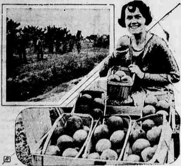
This Georgia miss (right) is sampling the 1930 peach crop. Typical harvesting scene is shown at left.

ATLANTA (AP)—Speaking of comebacks, how about Georgia peaches?