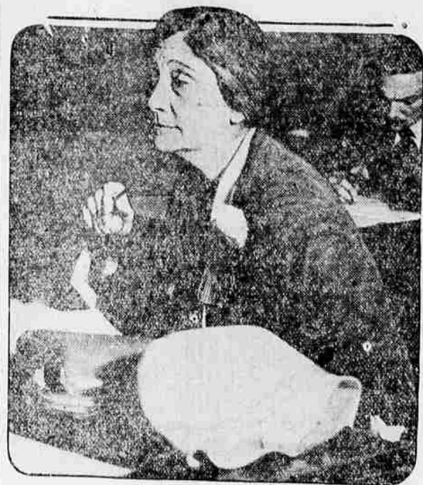
Ruth Hanna McCormick, republican senatorial nominee in Illinois, on the stand in her own defense in the senate committee's investigation of her campaign expenditures. The investigation was held in Chicago.