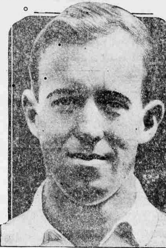
Wilmer Allison of Austin, Texas, who scored a smashing victory over the world's champion, Henri Cochet of France, today gained the right with John VanRyn of East Orange, N. J., to challenge the French for the Davis Cup.

back to the impromptu plantings of three years ago. Up until that time, it is said, Fish Lake never knew the meaning of eastern brook trout.