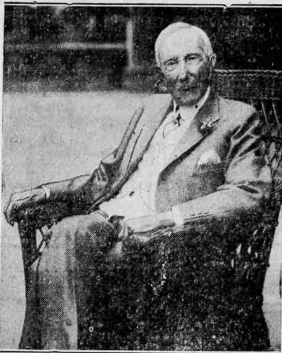
John D. Rockefeller celebrated his ninety-first birthday at his Pocantico Hills estate near Tarrytown, N. Y. Here is the birthday picture for which he posed on the eve of his ninety-first anniversary.