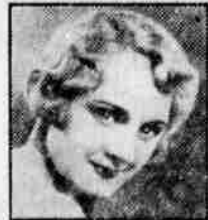
JOSEPHINE DUNN, popular M. G. M. star: "It's so refreshing!"

Use this fragrant white soap for the close-up complexion every girl wants. Order some and begin today.