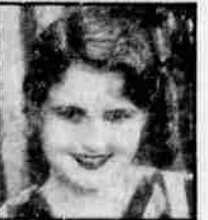
LOIS MORAN, beloved Fox star: "I always use it. It's a joy."