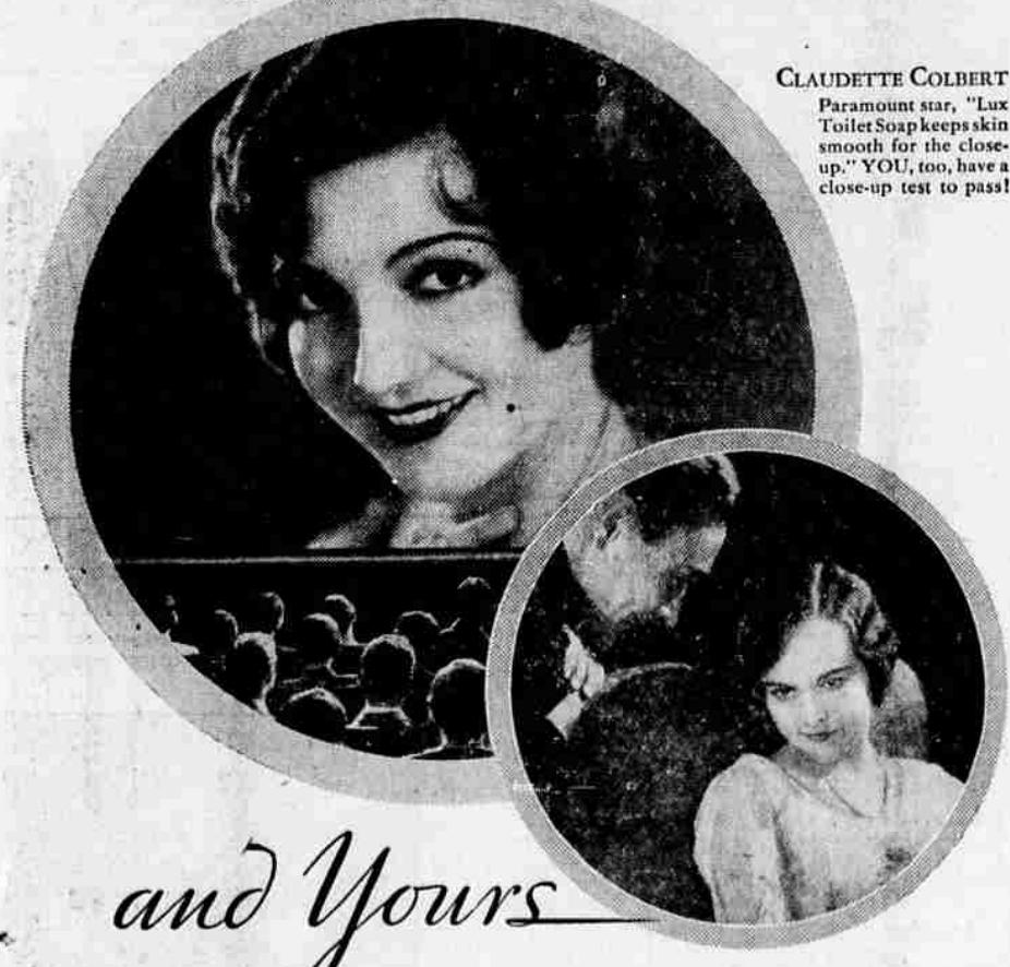
CLAUDETTE COLBERT Paramount star, "Lux Toilet Soap keeps skin smooth for the close-up." YOU, too, have a close-up test to pass!