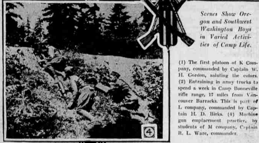
Scenes Show Oregon and Southwest Washington Boys in Varied Activities of Camp Life.