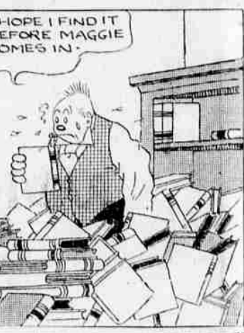
THE NEBBS—Look Out