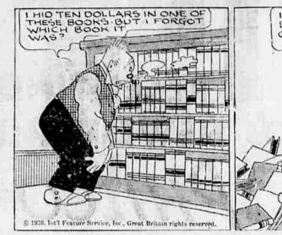
THE NEBBS—Look Out