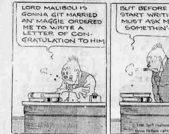
THE NEBBS—Duck Soup