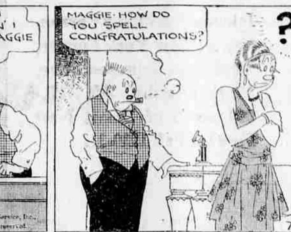
THE NEBBS—Duck Soup