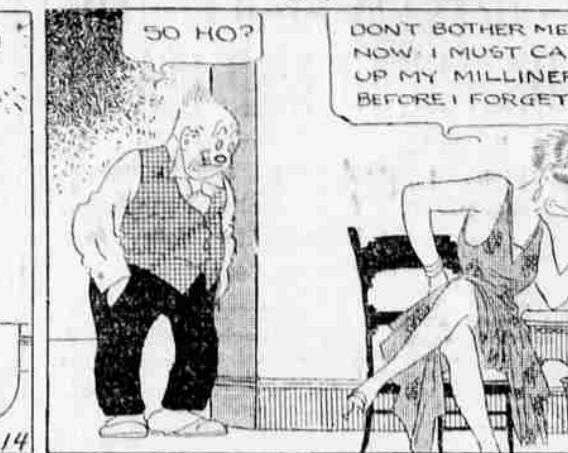
THE NEBBS—Duck Soup