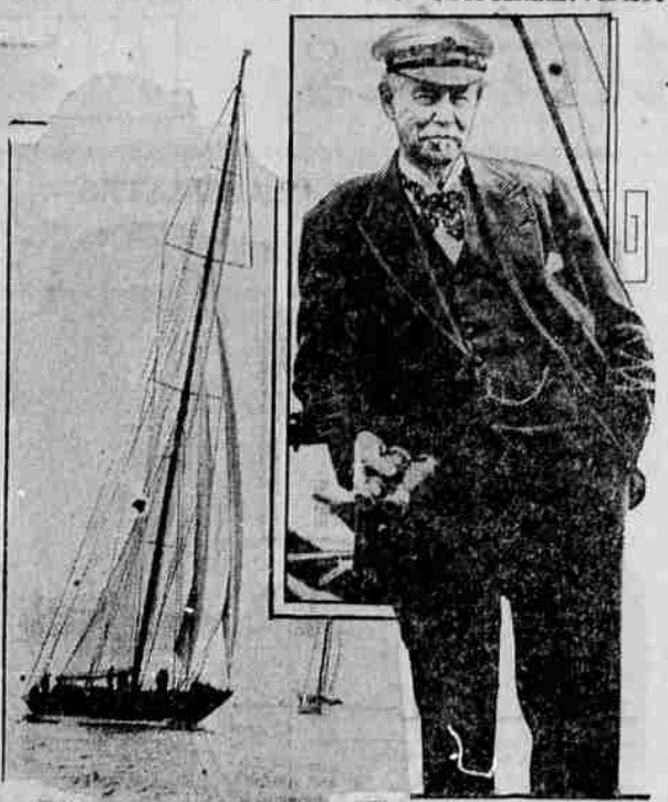
Sir Thomas Lipton watching the first trial of his America's cup challenger, Shamrock V, at Gosport, England.