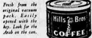
Free from the original vacuum pack. Easily opened with the key. Look for the Arab on the can.

You add the oil a little at a time to prevent the mayonnaise from separating. Hills Bros. roast their coffee a few pounds at a time to prevent variation in flavor. That's why this patented, continuous process is called Controlled Roasting. No bulk-roasting process can produce such a rich, delicious flavor.