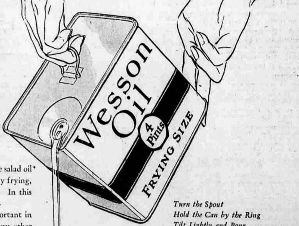
Turn the Spout Hold the Can by the Ring Tilt Lightly and Pour

IF YOU have considered this fine salad oil just a bit of a luxury for every day frying, try the 4-Pint Frying Size Can. In this size it's surprising how little it costs.