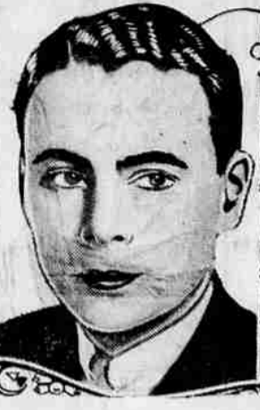
WILLIAM COLLIER, JR. In Mystery-Comedy, 'A Royal Romance,' now playing at the Fox Rialto theater.