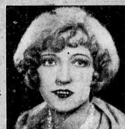
MARION DAVIES Metro-Goldwyn-Mayer star, says: "Lux Toilet Soap leaves the skin so smooth."