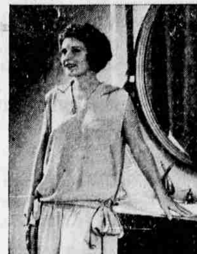
(Right) EVELYN BRENT alluring Columbia star, says: "Almost every girl I know in Hollywood uses it."

On Broadway, too, the stage stars are so dependent on its delicate luxury that it is in the dressing rooms of legitimate theaters all over the country—And even in Europe the screen stars know the secret of this dainty way to loveliness, and use this fragrant white soap for their beauty.