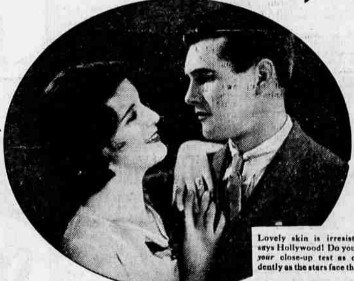
Lovely skin is irresistible, says Hollywood! Do you face your close-up test as confidently as the stars face theirs?