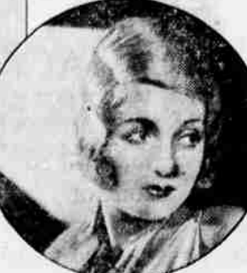
(Left) ANITA PAGE adored M. G. M. star: "I always use Lux Toilet Soap for my skin."