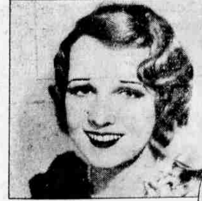
(Left) CONSTANCE BENNETT Pathé star, leaves the close-up fearlessly and says: "It's a wonderful soap."