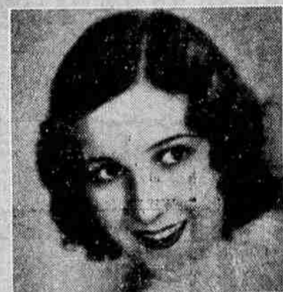
MARY BRIAN Paramount star, says: "Lux Toilet Soap keeps the close-up complexion perfect."