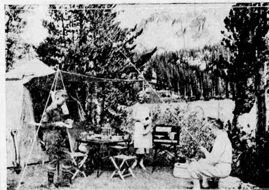
The highways of the West are becoming dotted now with thousands of vacationists on their way to favorite mountain retreats like the one pictured above. The automobile, good roads and modern camping equipment have joined together to furnish people a stronger incentive to go camping, according to the Western Auto Supply Company.