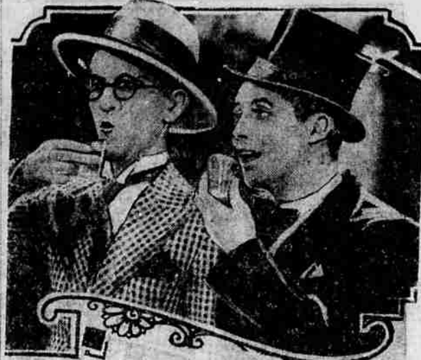
"The Cuckoos" opening today at the Fox Craterian theater, offers a new theme in talking pictures of the musical comedy type. The comedy is the keynote and is featured above singing and dancing. Bert Wheeler and Robert Woolsey, famous funmakers of "Hilaria," are headlined. In virtually every scene Wheeler and Woolsey are active with their clowning antics and wisecracks. June Clyde as the niece of the wealthy Jolyna Howland, is kidnapped by gypsies. Hugh Trevor plays her sweetheart. Wheeler and Woolsey appear as fortune tellers who use their psychic powers to locate the "gal." Their efforts along this line are the last word in comedy.